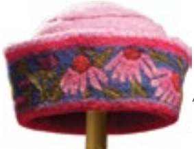
Artist: Nicole St-Pierre

to Gallery X, The New Bedford Art Salon, New Bedford Open Studios, New Bedford Puppetry Coalition, Gallery 65, Reynolds DeWalt, advertisers in the Guide, and many local visual artists who have assisted in the production.