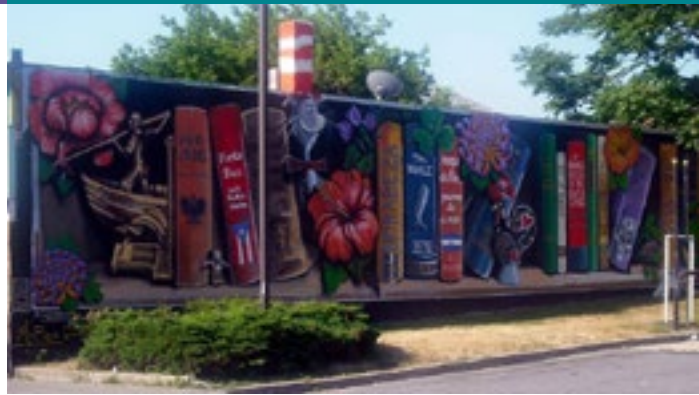
New mural on Acushnet Ave. by artists Ryan Mcfee and Todd Woodward.

Sculpture, Furniture geyangwood.com geyangwood@gmail.com